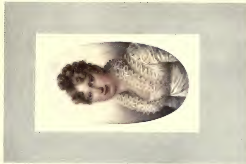
THE EMPRESS MARIE LOUISE BY JEAN BAPTISTE ISABEY